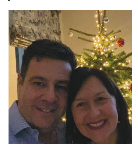
a Merry Christmas and a healthy, prosperous 2025.

For now, with the Christmas holiday ahead, I want to take this moment to express my heartfelt thanks to each and every one of you for your contributions and to wish you and your families